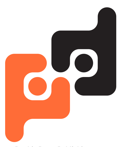
Pyrrhic Press Publishing 2024